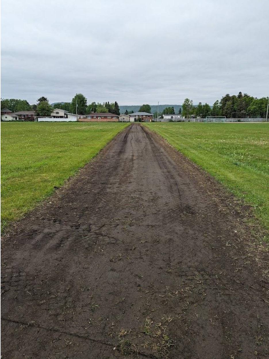
Existing field post tilling and packing – note surface has degraded to dirt and edges are not well defined.